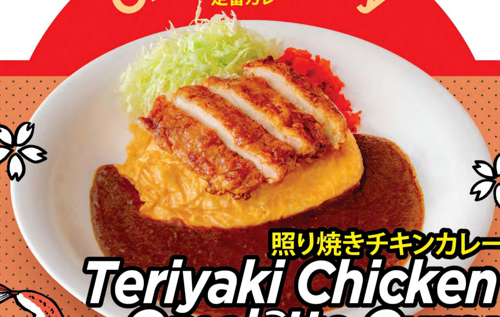
照り焼きチキンカレー Teriyaki Chicken Omelette Curry Boneless chicken thigh with teriyaki sauce and omelette