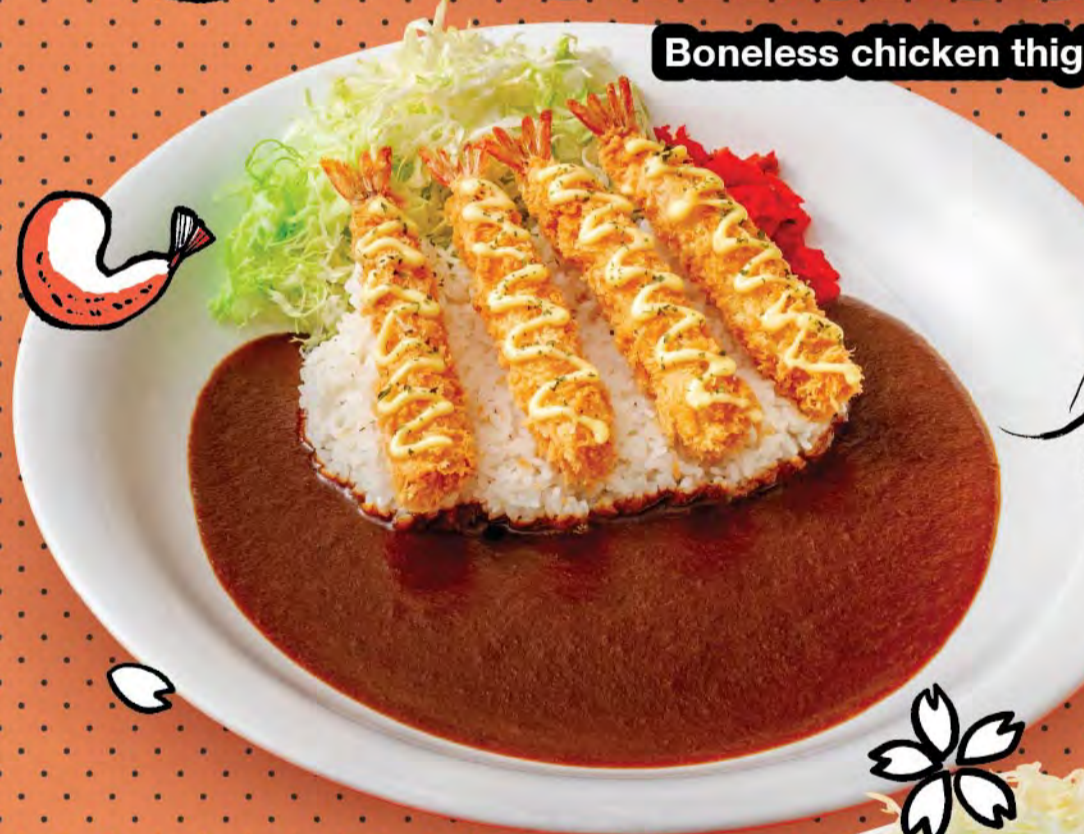
エビフライカレー Ebi Fry Curry Fried breaded shrimp topped with mayo