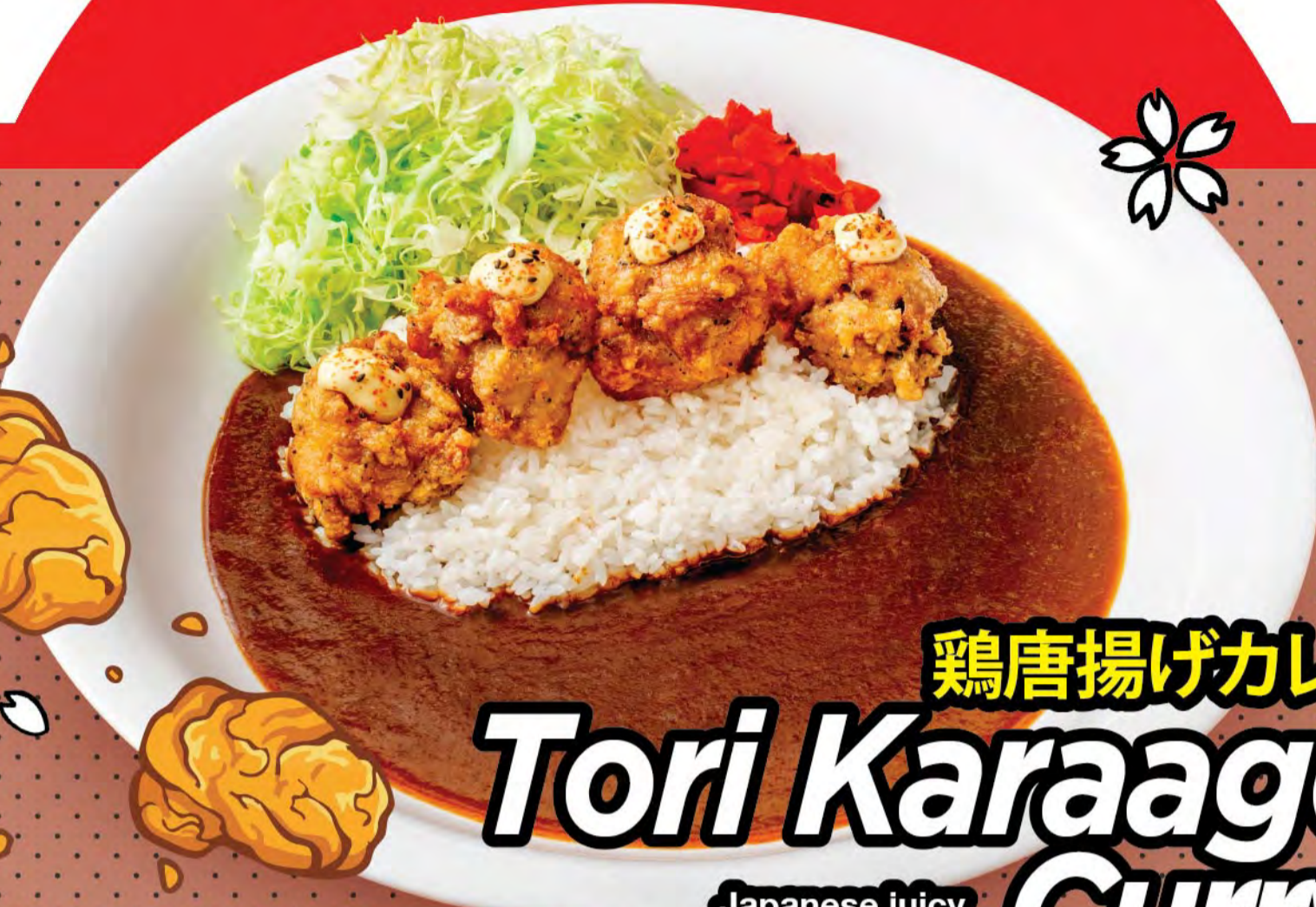
鶏唐揚げカレー Tori Karaage Curry Japanese juicy fried chicken thigh with mayo