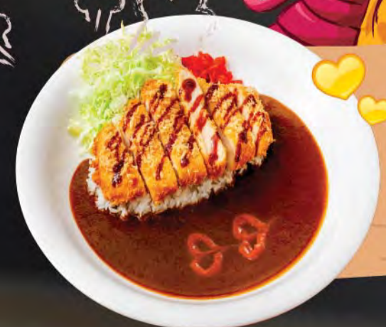
Whopping Jumbo-sized Chicken Katsu (200g)