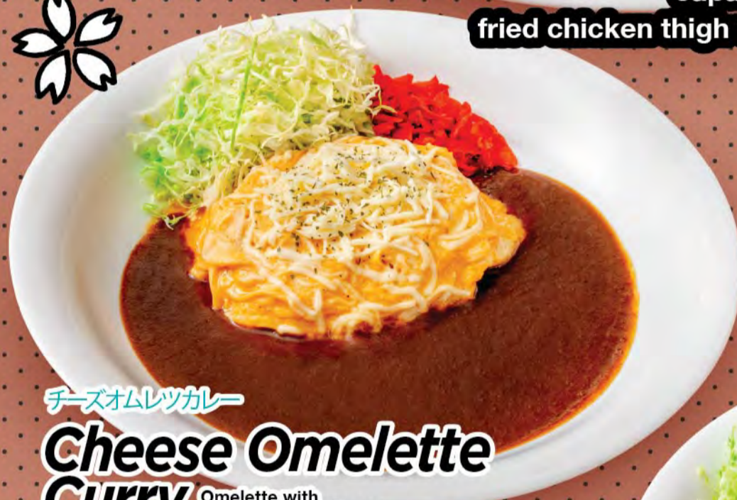
チーズオムレツカレー Cheese Omelette Curry Omelette with flame-torched cheese